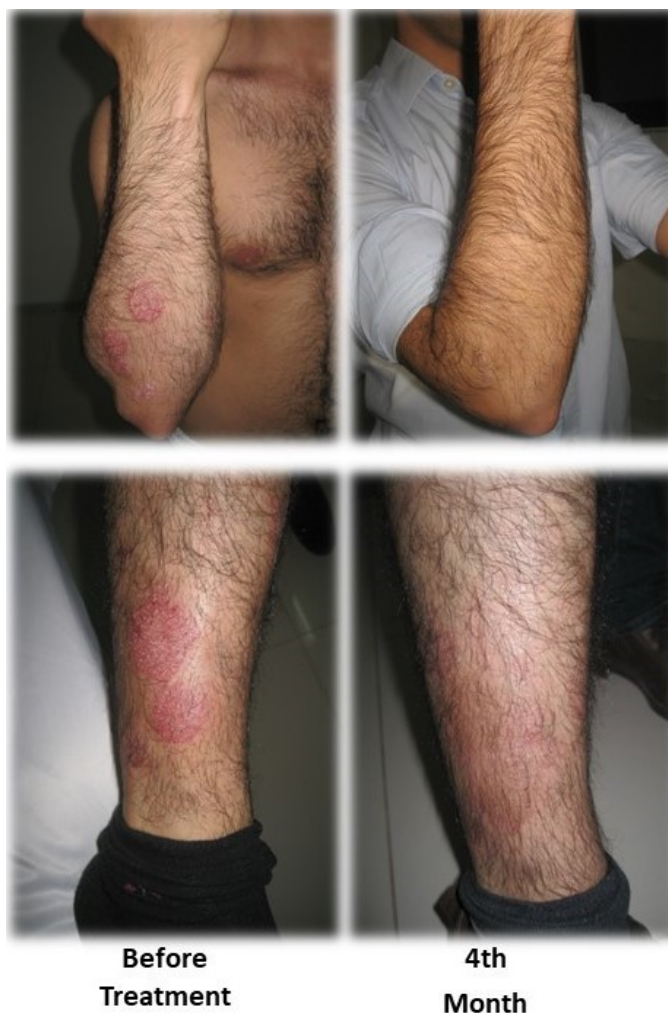
Figure 1. Before treatment and 4th month photos that possess 26 years old male with localized plaque lesion on the extremities.

The case was a 26 years old male with localised plaque lesion on the extremities and was suffering from the disease for 1.5 years. There is no stress factor which triggers the disease about case 1. The case was cured with RTM consists of different holistic approaches and phytotherapeutic agents in four months (Figure 1). Following RTM protocol was used for Case 1.