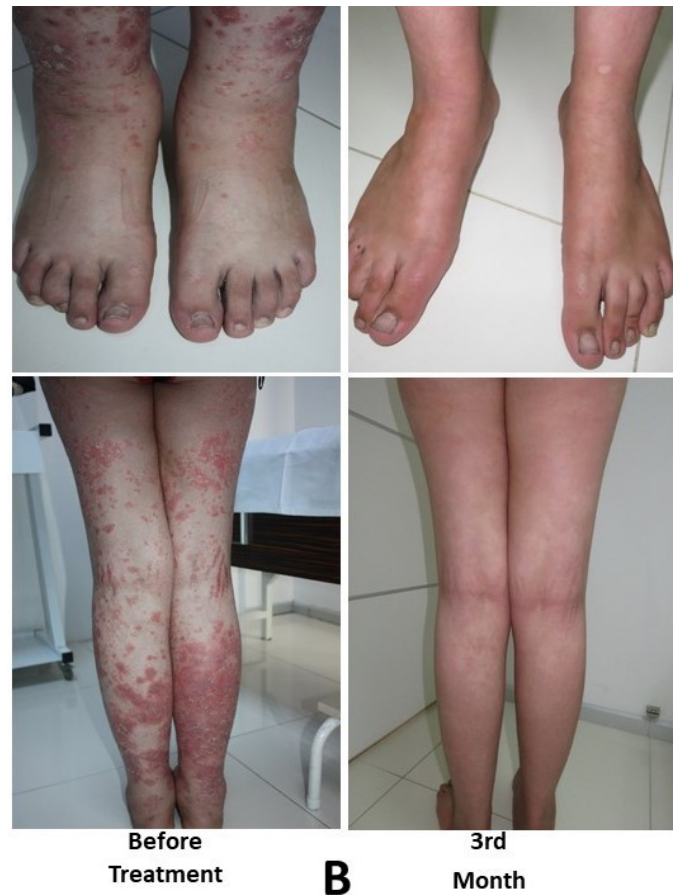
Figure 4 A,B: Before treatment and 3th month photos that possess 14-year-old female who had widespread plaque lesions characterized by widespread plaque lesions on the extremities and the body.